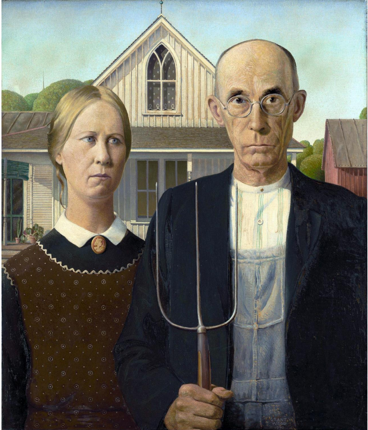
Wood, G. (2012, 15 de mayo). American Gothic [Imagen digital] https://commons.wikimedia.org/wiki/File:Grant_DeVolson_Wood_-_American_Gothic.jpg