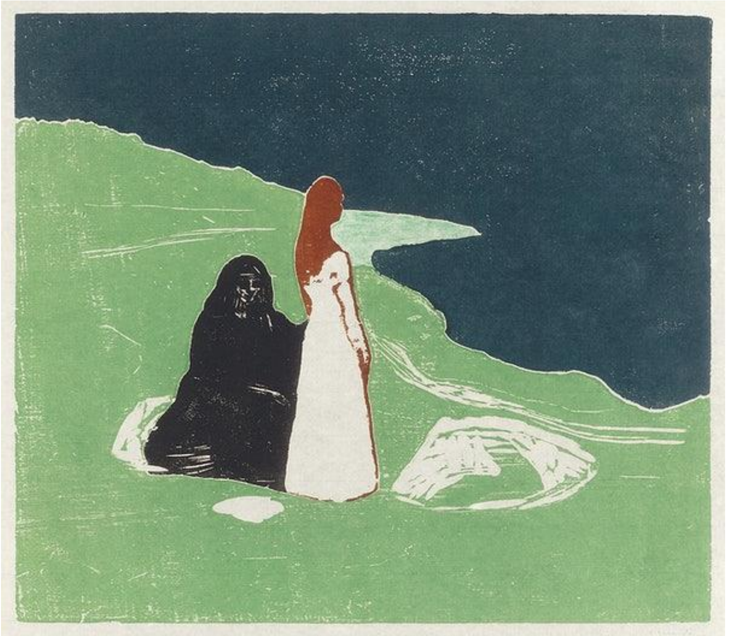
Munch, E. (s.f.). Dos mujeres en la orilla [Imagen digital].