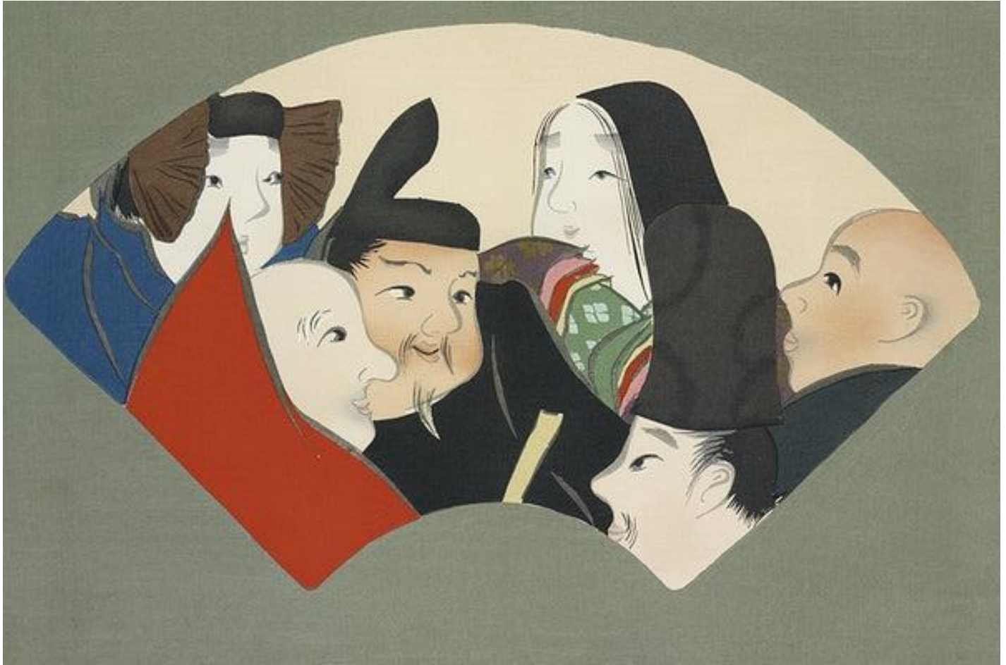
Sekka, K. (s.f.). Rokkasen de Momoyogusa - Flores de cien generaciones [Imagen digital]. https://www.rawpixel.com/image/2049622/japanese-woodcut-print-kamisaka-sekka