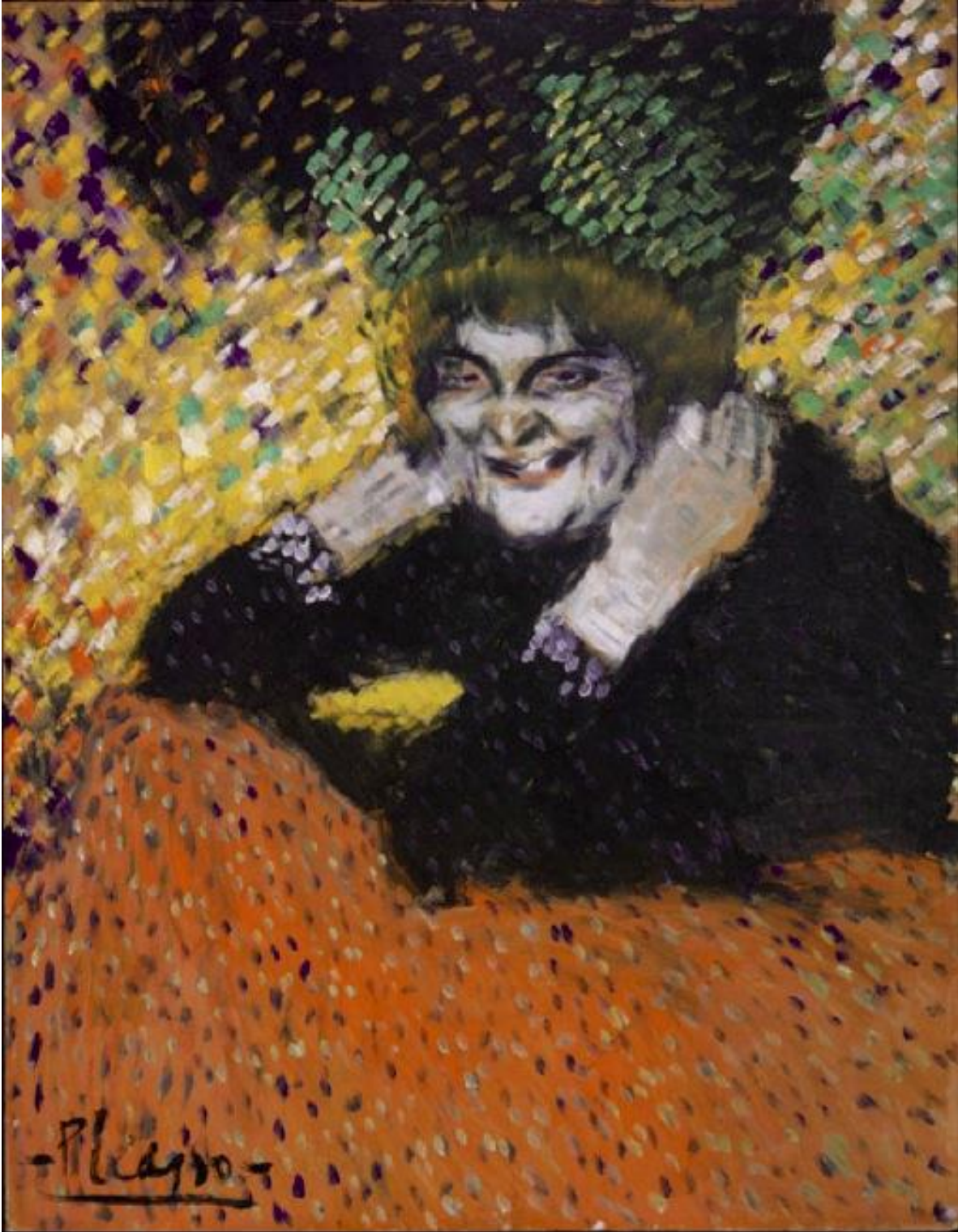
Pablo Picasso, 1901, Mujer anciana (Mujer con guantes) , óleo sobre cartón, 67 × 52,1 cm, Museo de Arte de Filadelfia