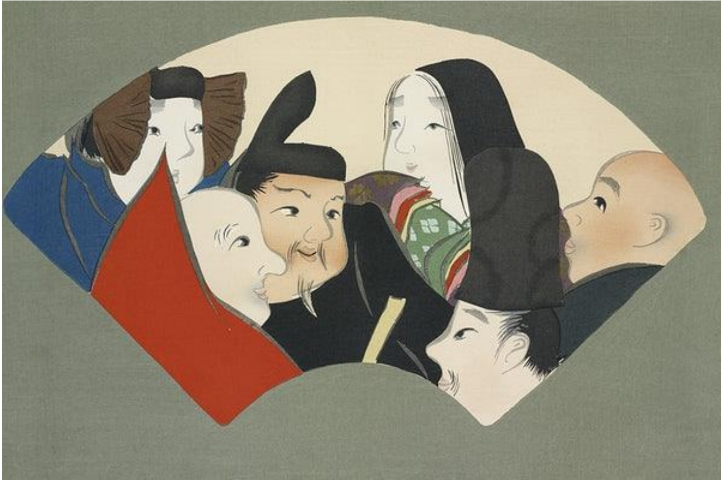
Sekka, K. (n.d.). Rokkasen from Momoyogusa—Flowers of a Hundred Generations [Digital image]. https://www.rawpixel.com/image/2049622/japanese-woodcut-print-kamisaka-sekka