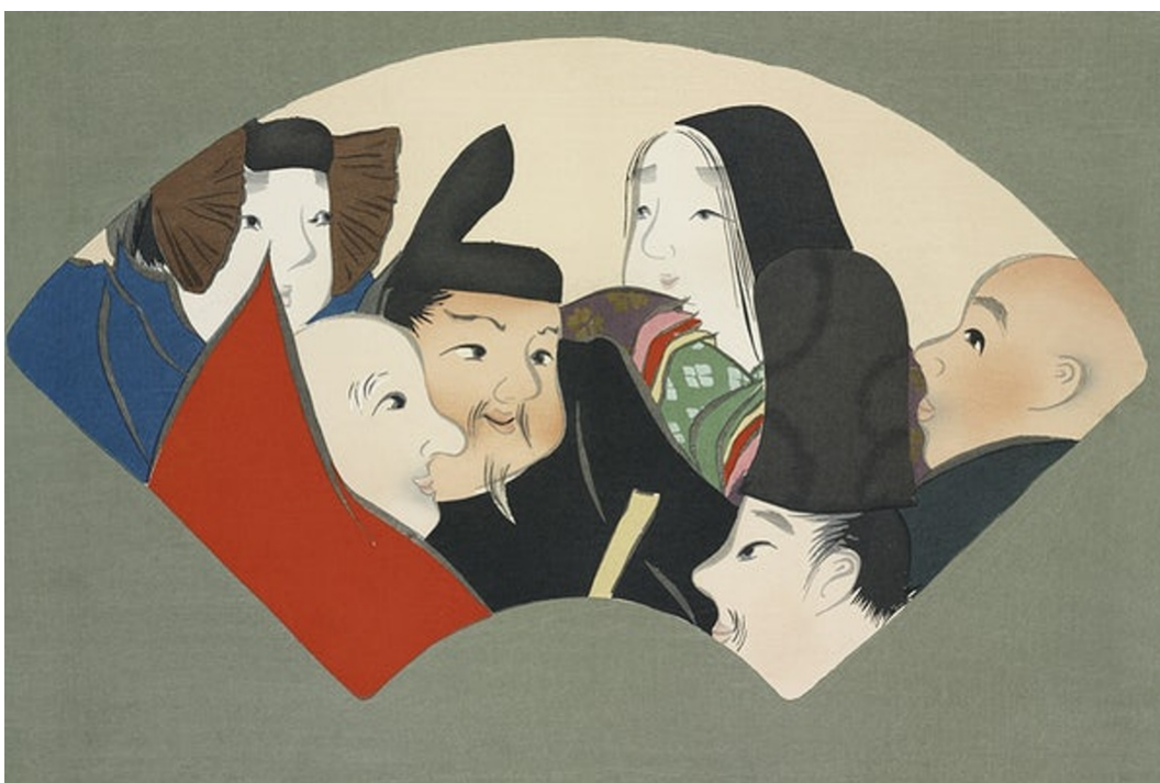
Rokkasen from Momoyogusa—Flowers of a Hundred Generations (1909) Kamisaka Sekka

Move to slide 22 and instruct your students to choose one of the works of art and to compose dialogue for this character. The section of dialogue should be in response to the prompt: "How am I feeling? What am I thinking?" Students should review the examples of internal and external dialogue from their handout, review the rules for punctuating dialogue, and choose a work of art from the Dialogue Art choices. Once they have done this, instruct them to write four sentences of dialogue in which their character responds to the prompt: "How am I feeling? What am I thinking?" They should use external dialogue between characters, internal dialogue, or both, and they should imagine an event or situation that is driving this dialogue.