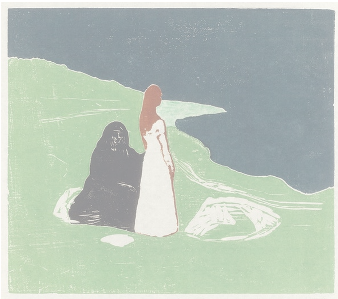
Two Women on the Shore (1898) Edvard Munch