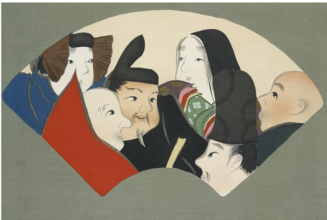
Rokkasen from Momoyogusa—Flowers of a Hundred Generations (1909) Kamisaka Sekka

Move to slide 22 and instruct your students to choose one of the works of art and to compose dialogue for this character. The section of dialogue should be in response to the prompt: "How am I feeling? What am I thinking?" Students should review the examples of internal and external dialogue from their handout, review the rules for punctuating dialogue, and choose a work of art from the Dialogue Art choices. Once they have done this, instruct them to write four sentences of dialogue in which their character responds to the prompt: "How am I feeling? What am I thinking?" They should use external dialogue between characters, internal dialogue, or both, and they should imagine an event or situation that is driving this dialogue.