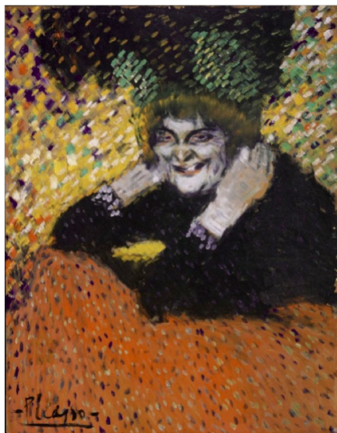
Old Woman (1901) Pablo Picasso