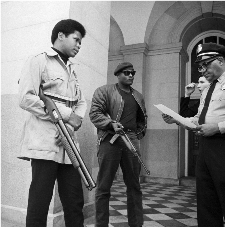
Morgan, T. (2018, August 30). The NRA supported gun control when the Black Panthers had the weapons. History.com . https://www.history.com/news/black-panthers-gun-control-nra-support-mulford-act