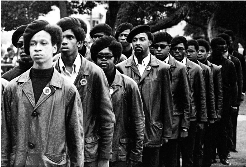
James, S. (2016, October 19). Panthers line up at a Free Huey rally [Photograph found in Steven Kasher Gallery, Oakland]. https://www.anothermag.com/fashion-beauty/9194/retracing-the-creative-legacy-of-the-black-panthers