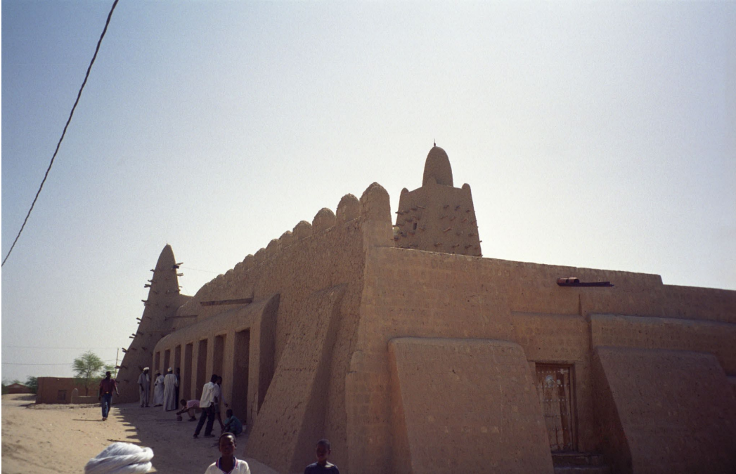
Figure 3: Uppyenoz. Djinguereber in Timbuktu