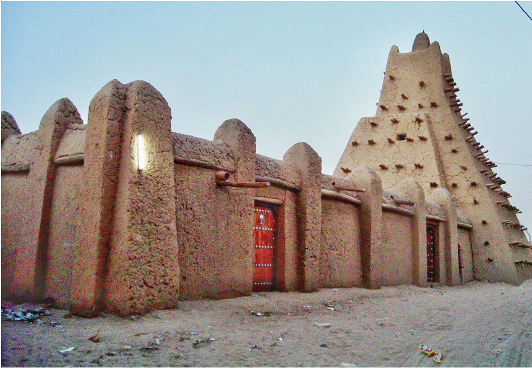
Figure 4: 2007 Sankore Mosque Timbuktu