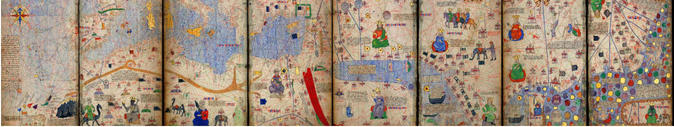
Figure 1: 1375 Atlas Catalan Abraham Cresques

Image Set 1 – Part of the Catalan Atlas, created in 1375 at the request of the King of France. Mansa Musa is pictured in the bottom of the second panel and an up-close image of Mansa Musa is shown below the atlas.