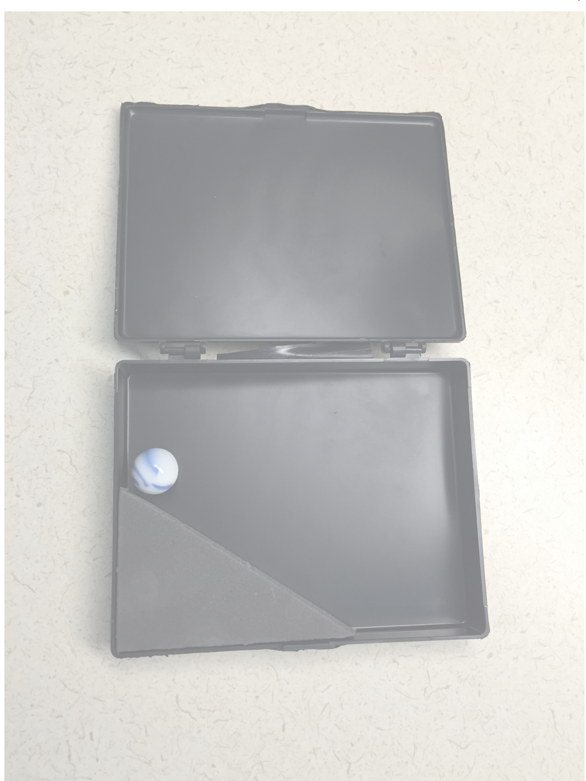
Inside of Sample Black Box