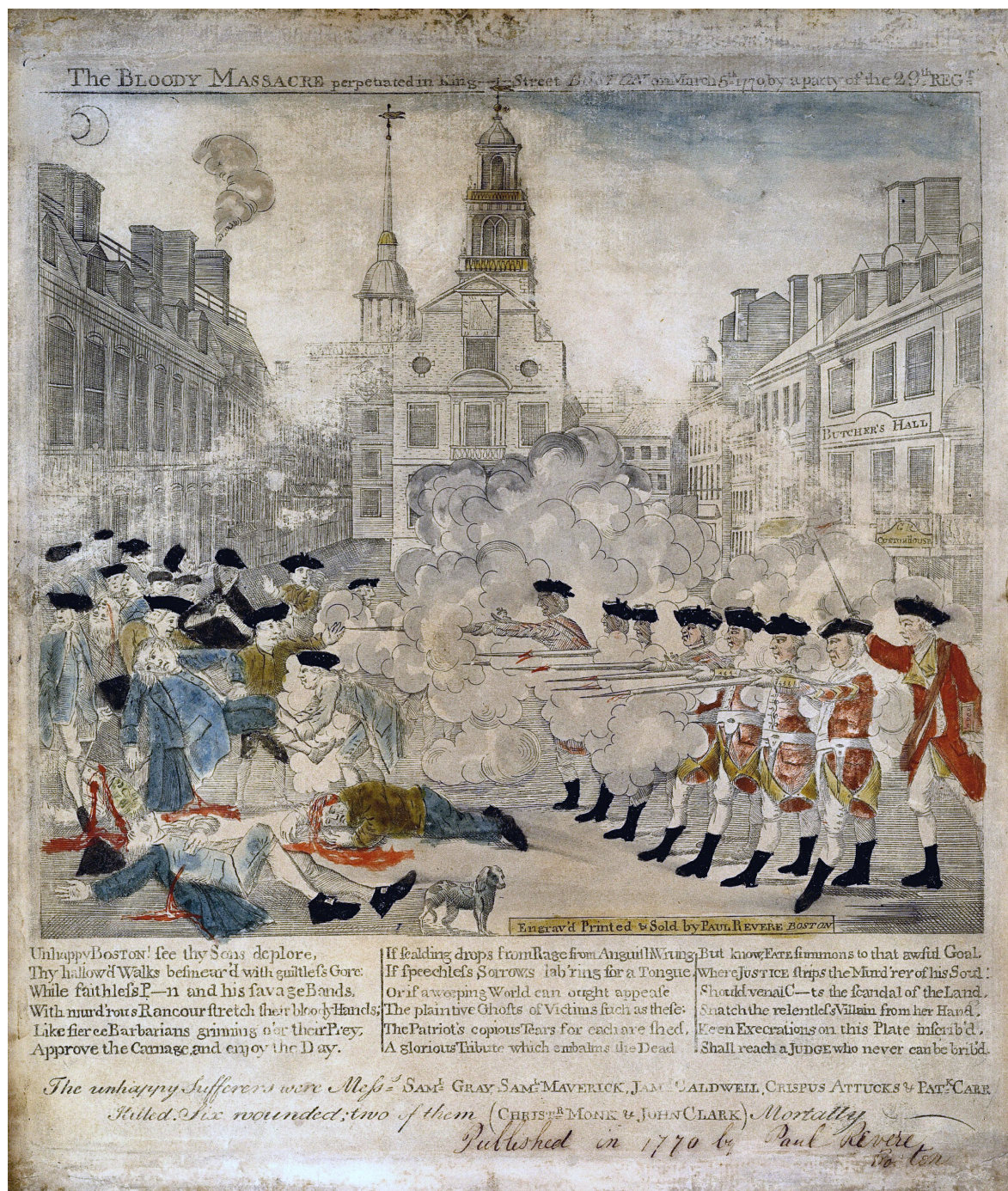
Image 1 - Boston Massacre as Portrayed by Paul Revere

Distribute the attached I Notice, I Wonder handout and ask students to examine the image closely, making observations ("I Notice") and generating questions and inferences ("I Wonder") about the image.