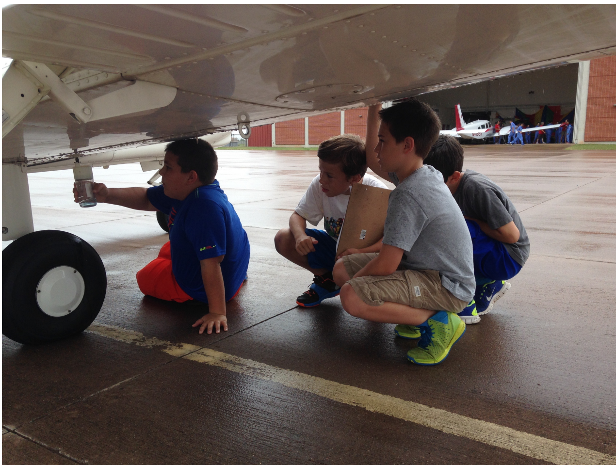
Sooner Flight Academy. (n.d.). SFA-Checking Fuel . University of Oklahoma.