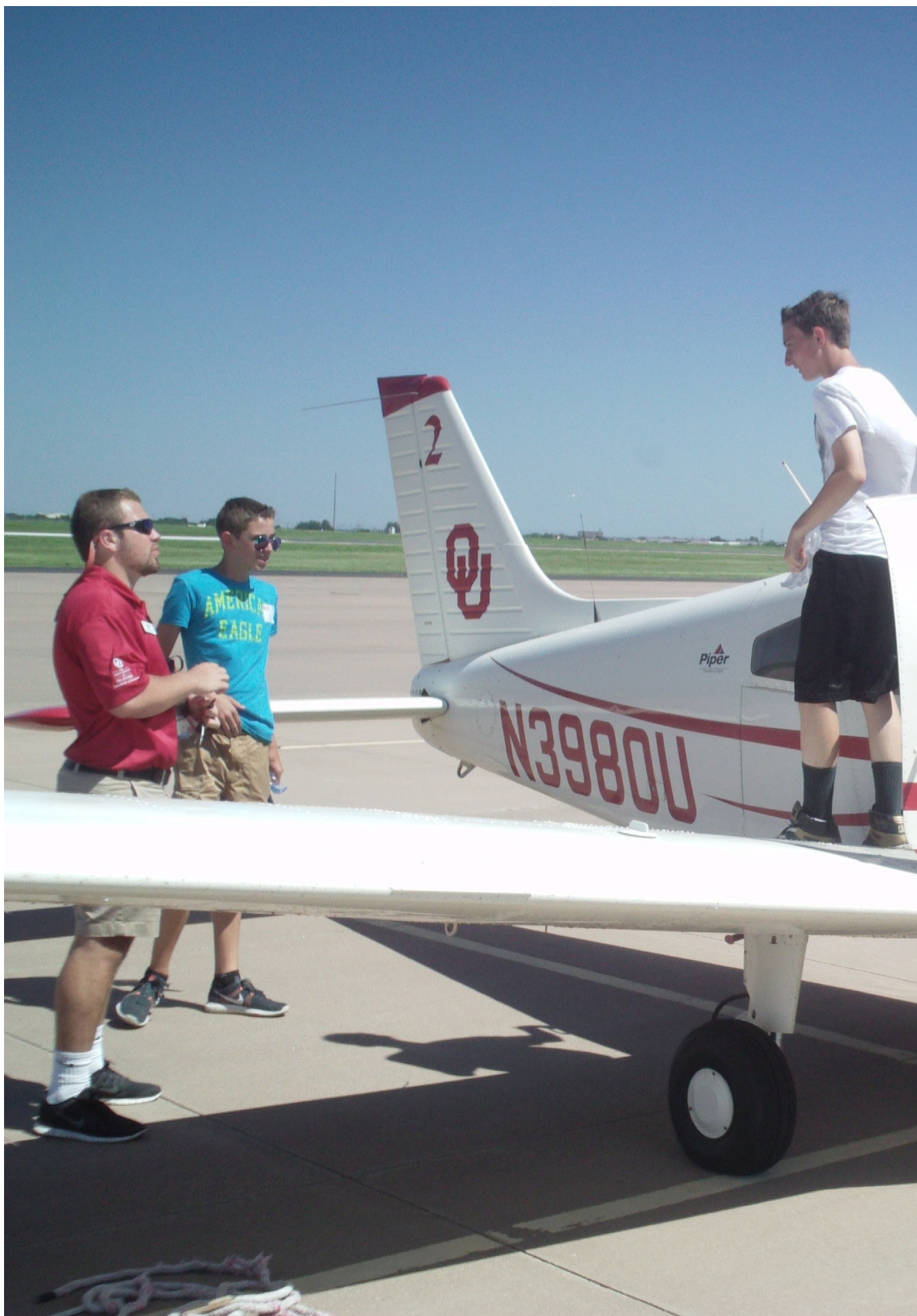
Sooner Flight Academy. (n.d.). SFA-Flight2 . University of Oklahoma.