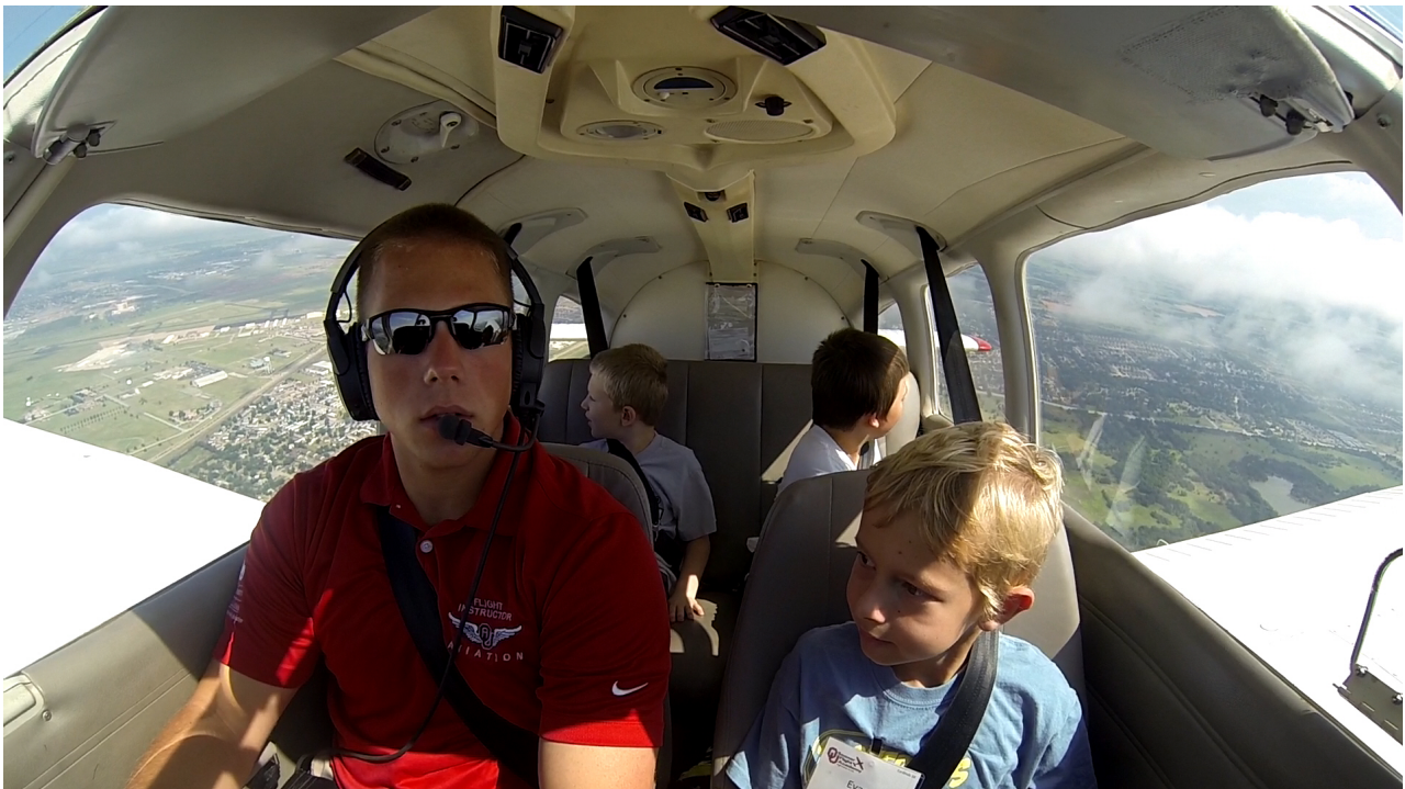
Sooner Flight Academy. (n.d.). SFA-Flight. University of Oklahoma.

Being a pilot isn't the only career to explore in the Transportation, Distribution, and Logistics career cluster. Check out the other careers classified as Transportation, Distribution, and Logistics work to see even more options for careers that let you work while seeing the world, helping others, and solving problems.