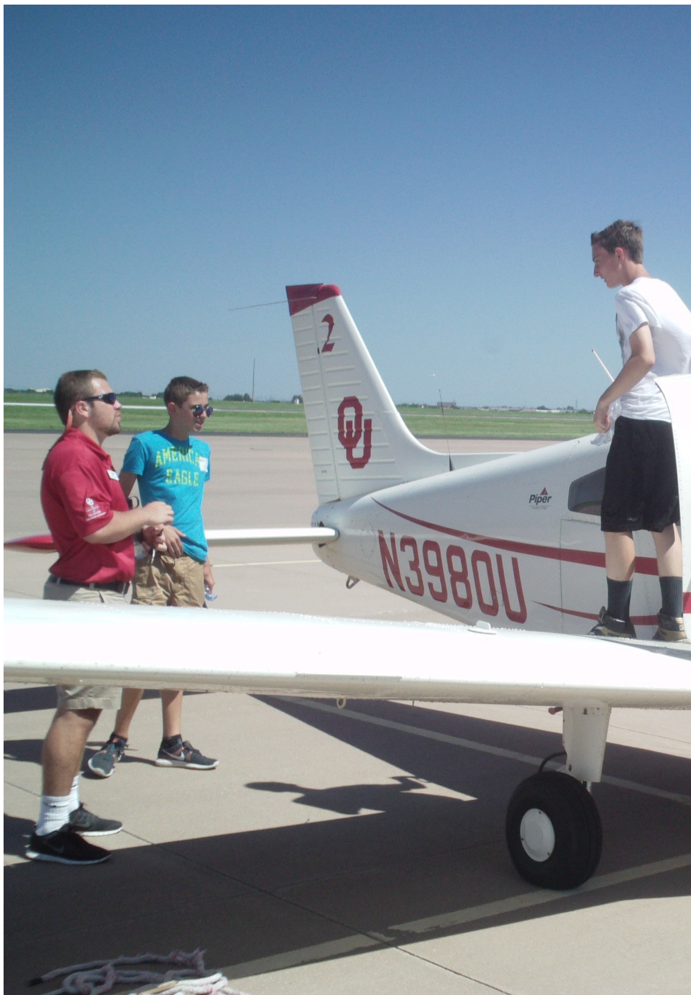
Sooner Flight Academy. (n.d.). SFA-Flight2 . University of Oklahoma.