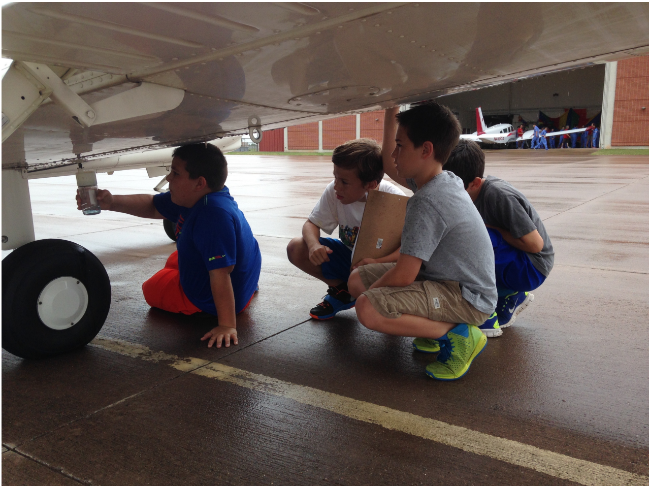
Sooner Flight Academy. (n.d.). SFA-Checking Fuel . University of Oklahoma.